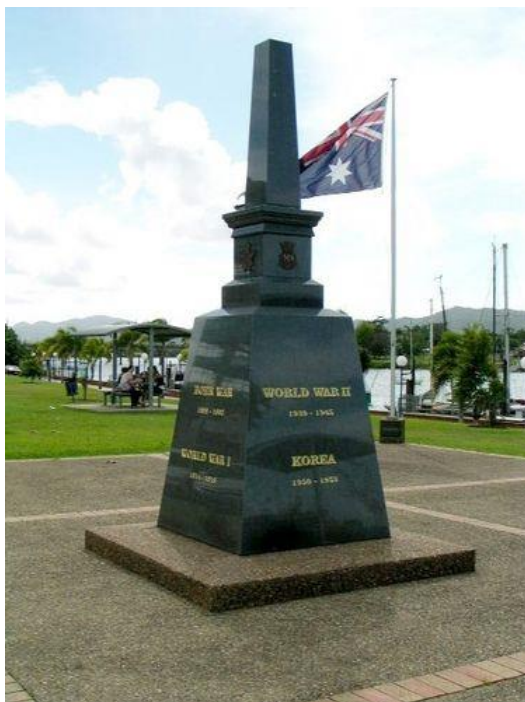
Innisfail Cenotaph