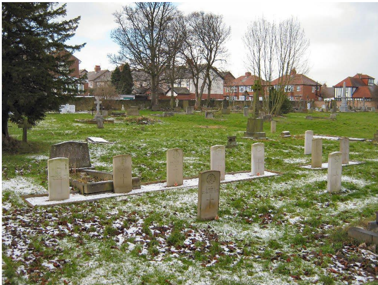
Ashburton Roman Catholic Cemetery, Gosforth

Ashburton Roman Catholic Cemetery, Gosforth contains 15 Commonwealth War Graves – 13 from World War 1 & 2 from World War 2. There are 2 Australian War Graves from World War 1.